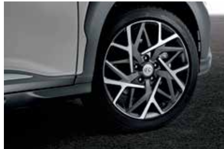
Alloy wheels with Michelin tyres