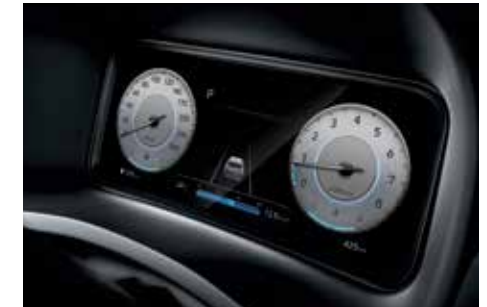
10.25" Full color supervision cluster