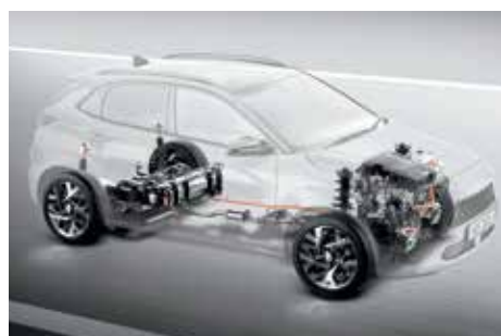
Best-in-Class fuel economy