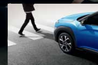
Forward Collision Avoidance Assist