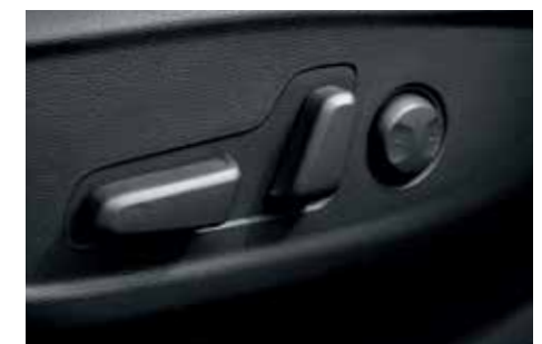
Front electric seats