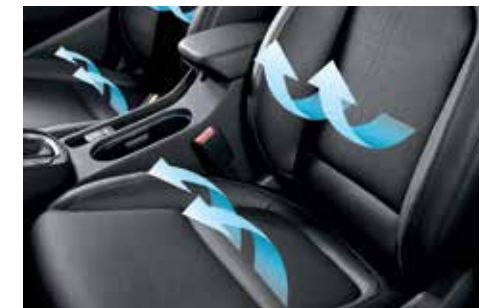
Front heated and ventilated seats