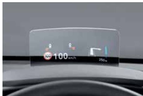
Heads up display