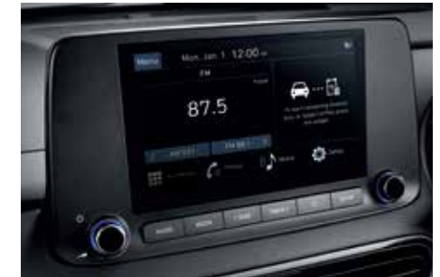
8" touchscreen infotainment system