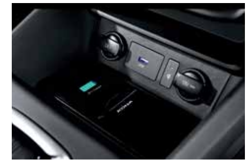
Wireless Smartphone Charger

Specifications are subject to changes without prior notice