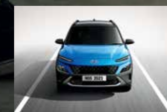
Lane Keeping Assist