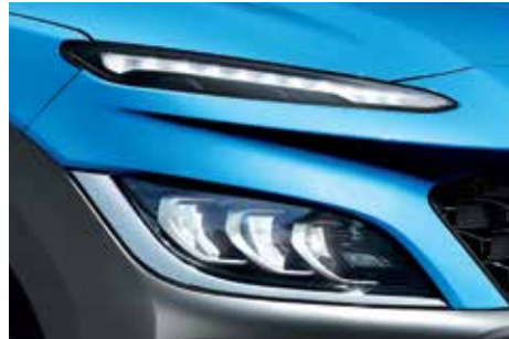
Twin headlight design