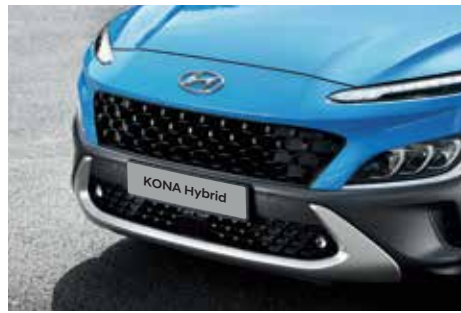
Newly sculpted front grille design