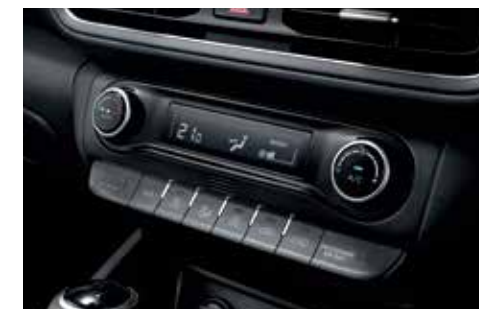
Full auto air conditioning