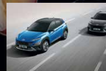
Blindspot Collision Avoidance Assist