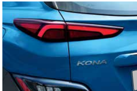
LED rear combination lamps