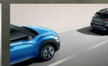
Smart Cruise Control with Stop & Go